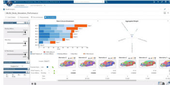
SIMULIA For Product Performance Analysis