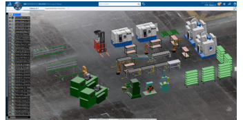
DELMIA For Plant Layout Design