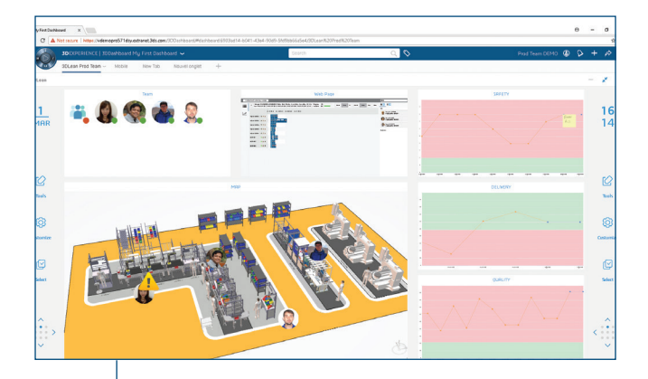
Visualization helps improve collaboration

For more information, please visit www.3ds.com/DELMIA